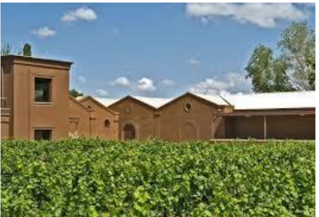
Tour and tasting in a historic wine cellar

This conference was possible thanks to the generous support of the United States