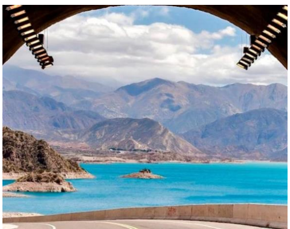
Lunch at Hotel Potrerillos